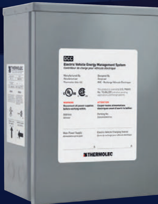
Part # THR-DCC-12

No electrical panel upgrade needed with the DCC-12